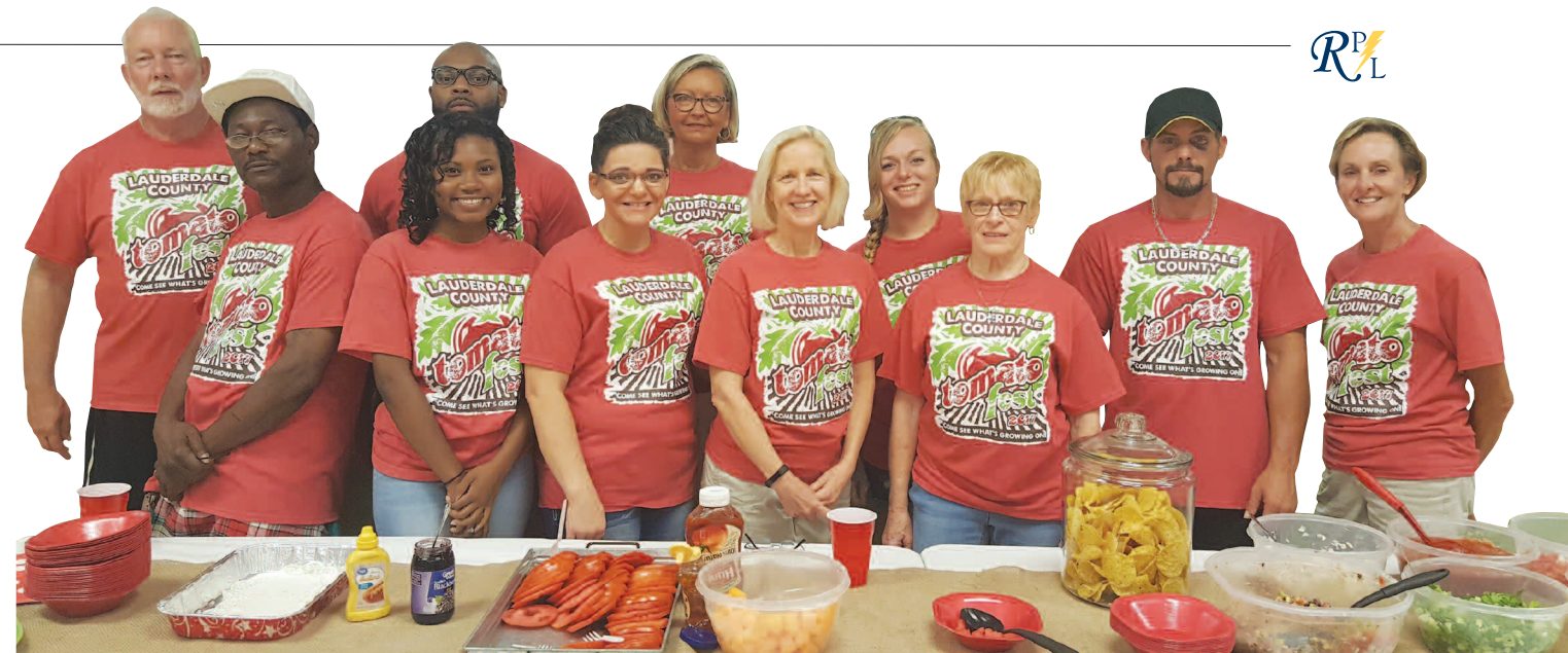
The staff at the Ripley Family Fitness Center cooks breakfast for the Tomato Festival's Chamber Coffee.