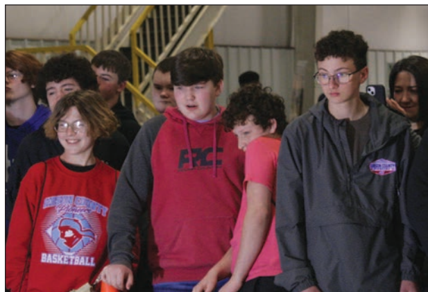
CLOCKWISE FROM ABOVE: Students watch a safety demonstration at the Ripley Power and Light booth at Pathways2Possibilities, a West Tennessee Eighth Grade Career Expo. Students generate enough electricity to power a cellphone as they pedal. Other students learn about careers in health care. Spot, the robotic dog, moves by remote control.