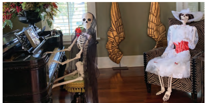
Clockwise from left, a woman and her dog stroll across the lawn at 162 S. Main St. in Ripley; the Barbee Mansion, in night and daylight settings, was ready for Halloween last year; house residents enjoy a little music; a bony Darth Vader waves to passersby.